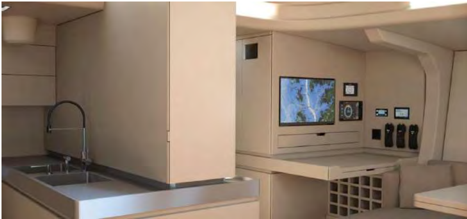
Scuderia 65 interior has been designed without forgetting its comfort onboard

The draft of the boat is bigger compared to other boats of its class. It is 4.2 m and the lifting keel facilitates the return to the ports with its 2.6 m lifted position. The keel strikes the harmony of the interiors that, although essential, give a feeling of home and comfort. The interior layout, starting from the bow, is divided into the shipowner's area, dinette, guest area and crew as well as the technical rooms of saillocker, engine room and lazaretto.