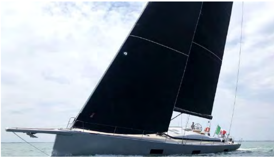
Scuderia 65 during first sea trials in racing configuration

The main idea of the whole project was to keep the minimum weight, so the whole interior along with the rig Southern Spars with the Future Fiber ECsix package, was to reduce the overall weight. But this is not just another cruiser/racer marketing ploy, but a true sailing concept, evidenced by the list of experts who honed their experience at the America's Cup, the Volvo Ocean regattas.