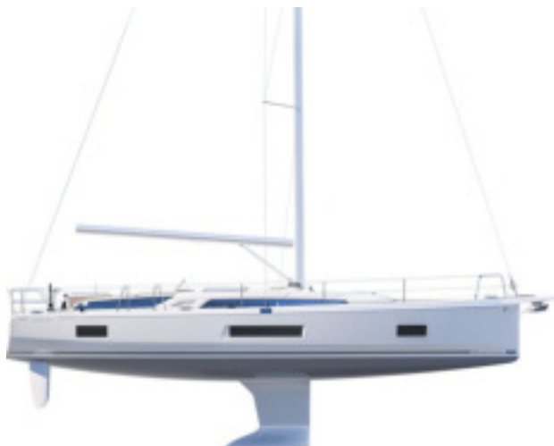
3 cabins 2 heads version: