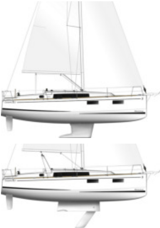
Sailing dinghy - Option: Arch