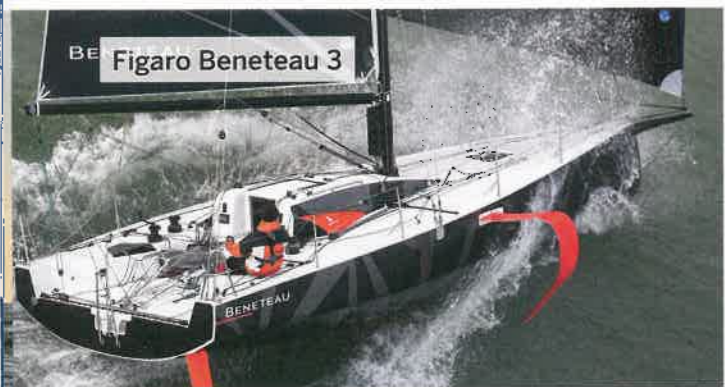
BE Figaro Beneteau 3

The storied U.S. builder Tartan is back on the scene with a new sloop from the drawing board of the company's long-time designer Tim Jackett. Conceived as a sporty cruiser that will work equally well daysailing, coastal cruising or crossing oceans, the Tartan 395 boasts an infused epoxy and vinylester hull along with a double-headsail rig of the kind long favored by veteran passagemakers. Three different keel options are available, all cast in lead for better righting moment. Best of all, Jackett has eschewed the Euro fashion du jour and instead created a contemporary iteration of the "American" yacht—hard as that look may be to actually define—that will remain attractive for generations to come. Tartan Yachts, tartanyachts.com