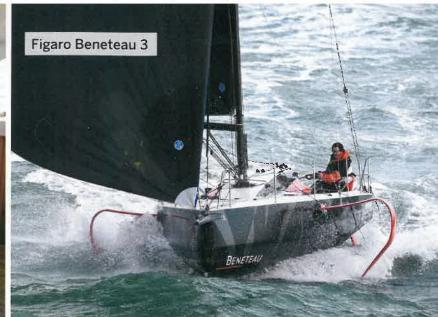
Figaro Beneteau 3