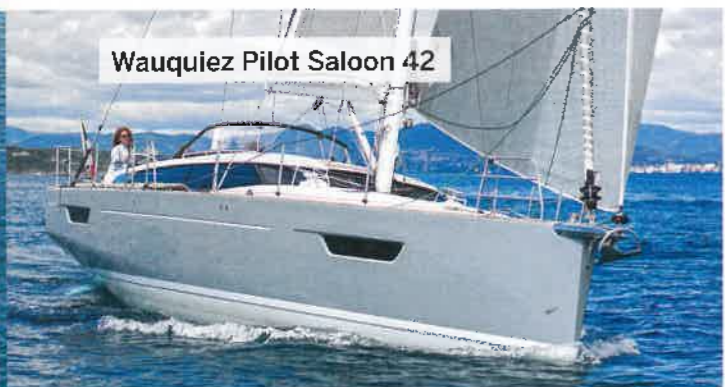
Wauquiez Pilot Saloon 42

After having been a bit on the quiet side the last couple of years, iconic Island Packet is under new ownership and back in the game with its fully revamped Island Packet 349. Features include a fully battened mainsail equipped with a low-friction Battcar system that drops easily into a pocket boom with an integral cover and lazy jack system; a highly customizable interior; and hull side ports for increased ambient light belowdecks. Three things that haven't changed are the boat's trademark full-keel, a self-tending Hoyt Boom for the working jib, and IP's rock-solid build quality. Looking forward to seeing more of IP in its latest guise! Island Packet Yachts, ipy.com