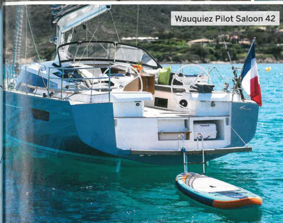
Wauquiez Pilot Saloon 42