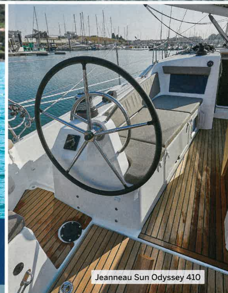
Jeanneau Sun Odyssey 410

WHERE TO SEE THEM Newport International Boat Show Sept. 13-16, newportboatshow.com Annapolis Boat Show Oct. 4-8, annapolisboatshows.com