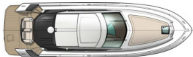
Version: Cockpit galley